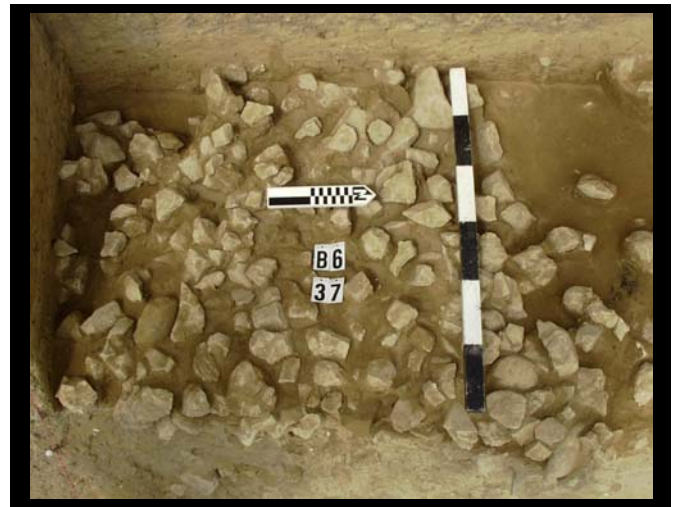
Right: An intact hearth eroding from the fields.