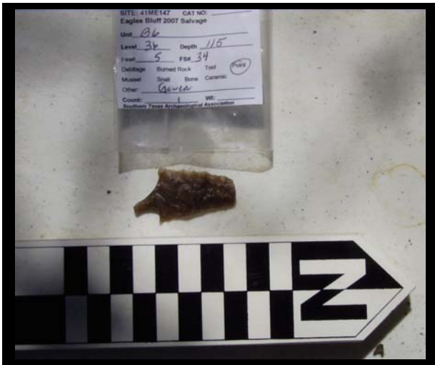
Left: A Gower projectile point