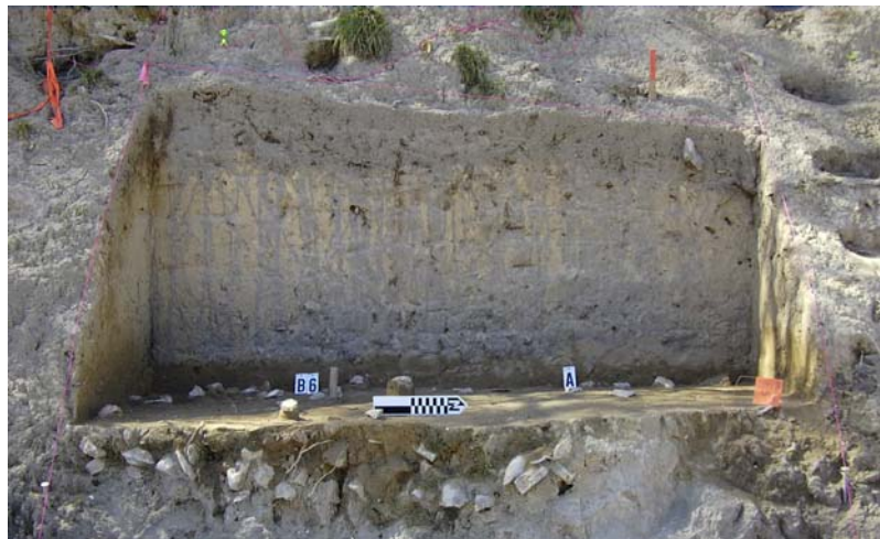
41ME147 unit A6 B6 / Level 36 350 – 360 cmbs.